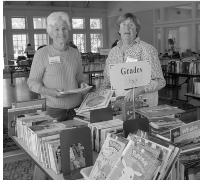
Friends volunteers help to make our sales successful!

HALF PRICE DAY! Sale open to the public. Prices slashed by 1/2 on ALL Book Sale items. Come back and see what bargains you can find.